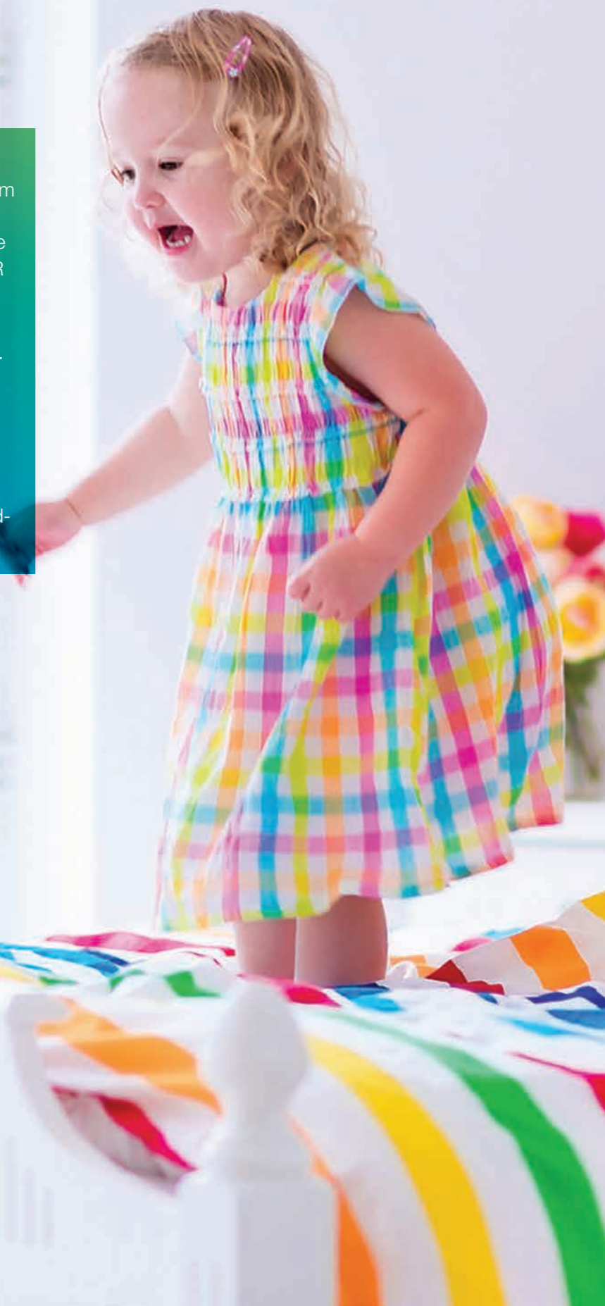
Formaldehyde Emission Test: EN717-1

Drying, viscosity and gloss properties can be easily adjusted with various additives depending on the hand-worker's needs or the industrial application.